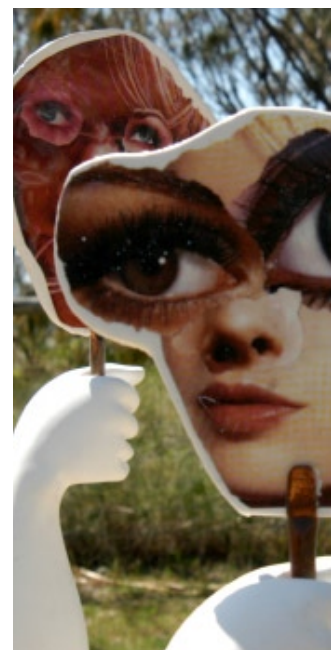
Ruth Park White Woman Dreaming Swell 07